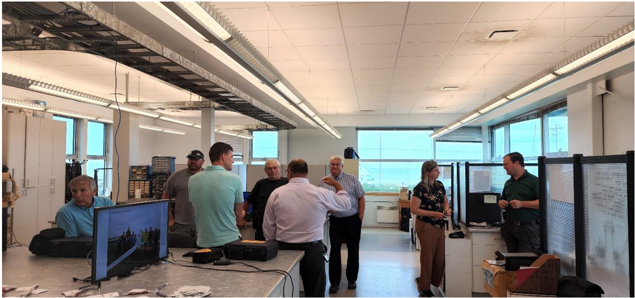
Current and former AWTS and WEICan Board, staff, and visitors in WEICan's laboratory during WEICan's open house anniversary celebration event