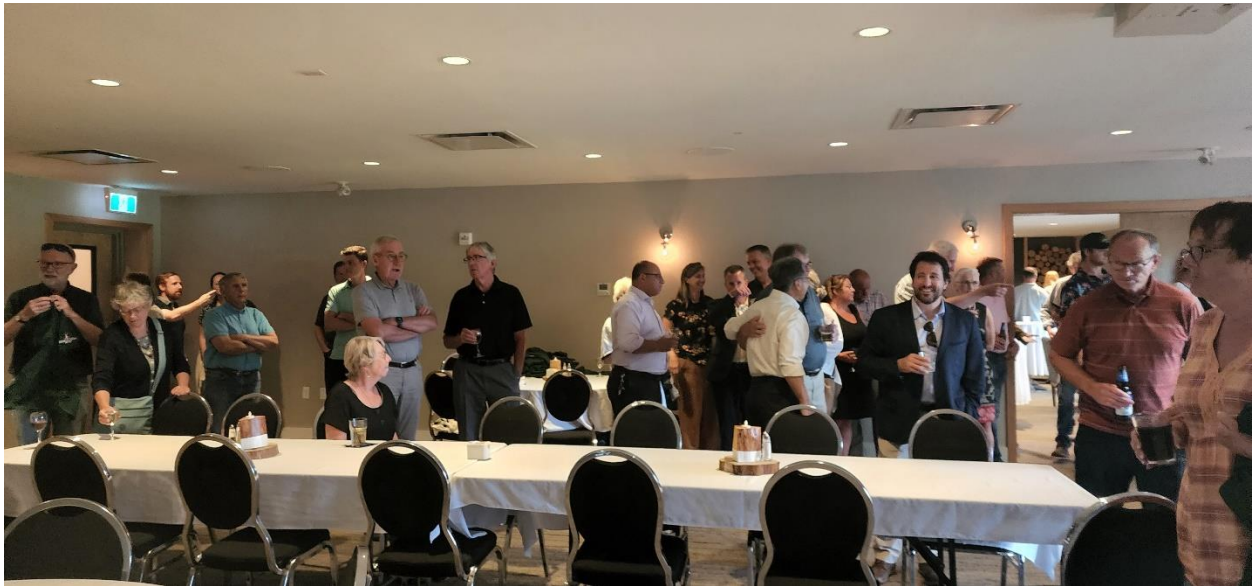
Current and former AWTS and WEICan Board, staff, and collaborators at Mill River Resort during WEICan's anniversary celebration reception