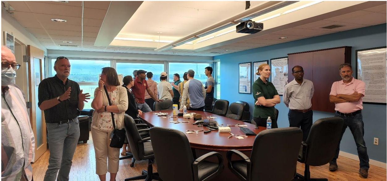
Current and former AWTS and WEICan Board, staff and visitors in WEICan's boardroom during WEICan's open house anniversary celebration event